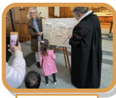
Easter Sunday Sermon