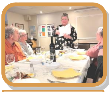
Seder Meal, Maundy Thursday