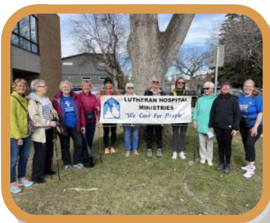
LHM Fundraising Walk