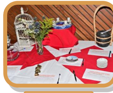
Silent Auction Items