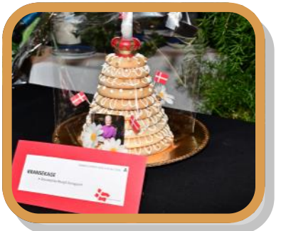
Live Auction Item