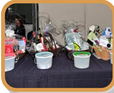
Baskets for Draw