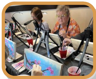
Viking Girls Painting Class