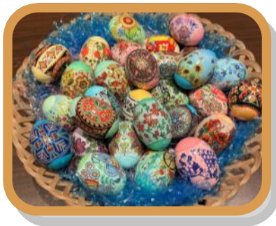
Eggs for Easter Lunch