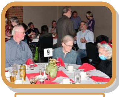
Dinner & Auction, April 19