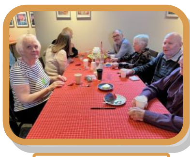
Cook-Off Lunch, April 7