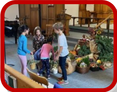
Kids help set up Thanksgiving Display