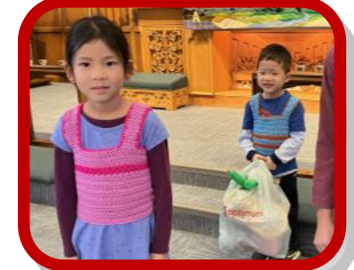
Two Cuties Modelling Vests