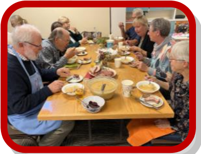
Traditional Danish Harvest Lunch