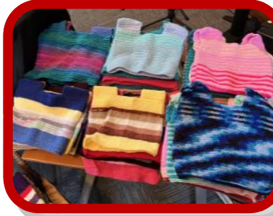
Lots of Colour and Variety