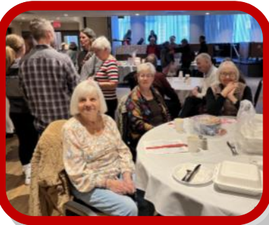
Part of the Crowd