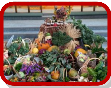
An abundance of produce