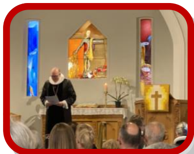
DSUK Bishop at Ansgar DLC