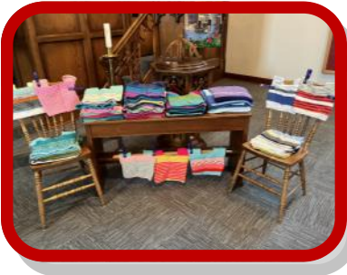
Pneumonia Prevention Vests