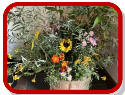
Harvest Service Decoration