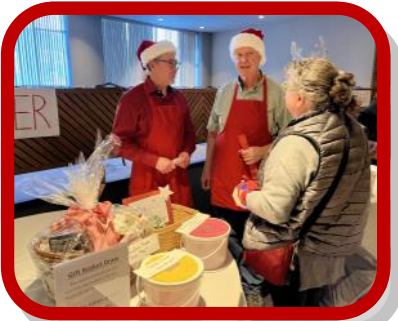
Two Bazaar Volunteers