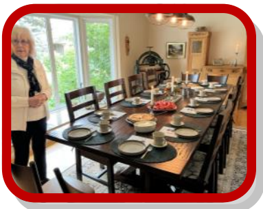
Viking Girls Coffee Time at Rita's